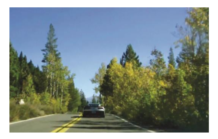
Fall colors were brightly displayed on the eastern slopes [see more pictures on pages 5-6.]

Rick helped us pack 10 Corvettes in his driveway