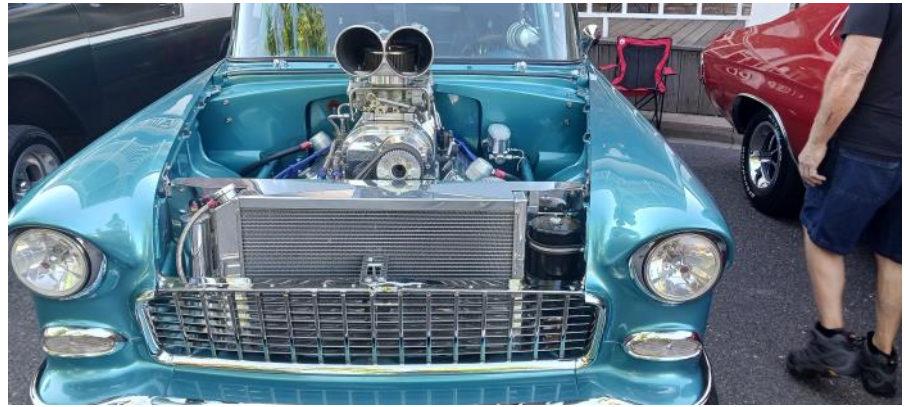
A couple neat rods that Rick Bronner saw at Rods to Rails