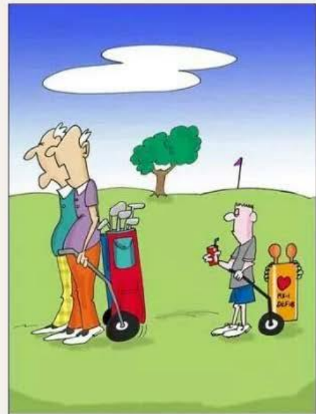
"I don't care if he is just trying to make a buck, following us with that defibrillator is unnerving."