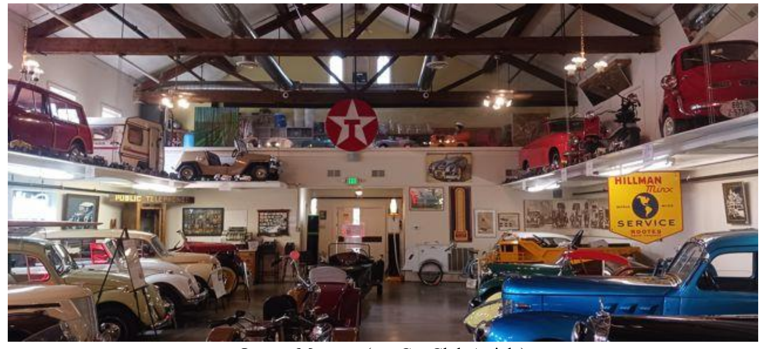
Lemay Museum (see Car Club Article)