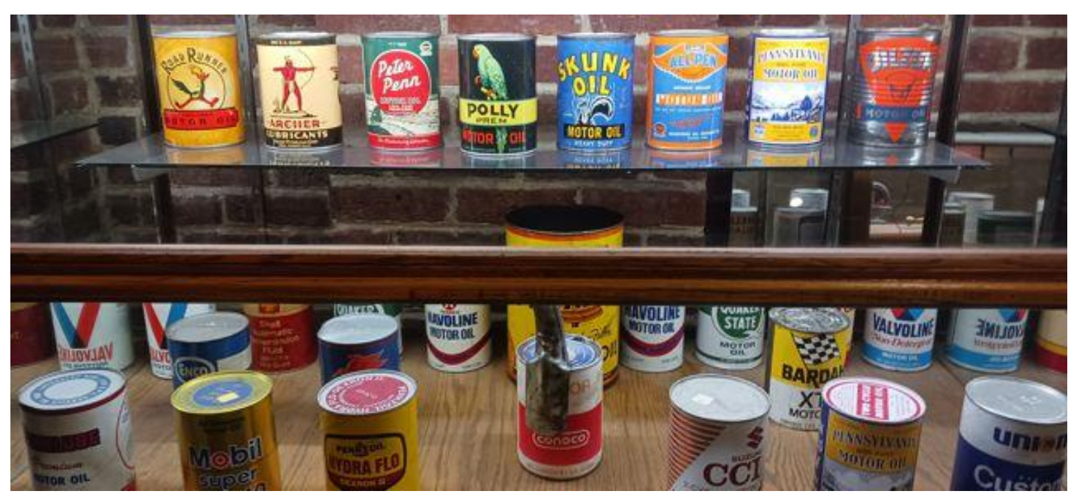
Lemay Museum (see Car Club Article)