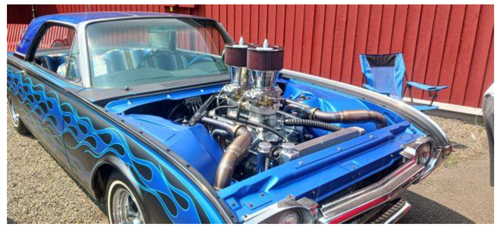
Good Guy's Show (see Car Club Article)