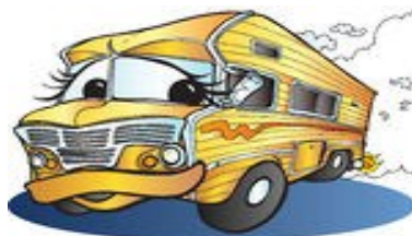
My real home has wheels