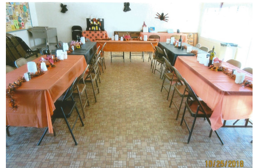
Pismo Beach with the RV Club