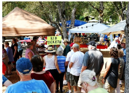
August Family Picnic