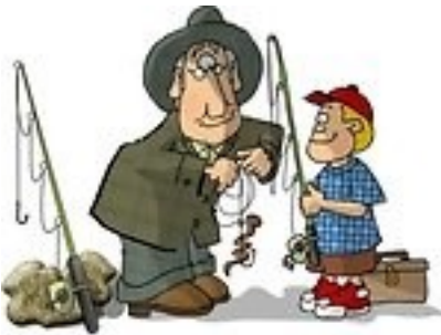
Fishing with Grandpa: Wow!