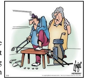
"Did you win?"