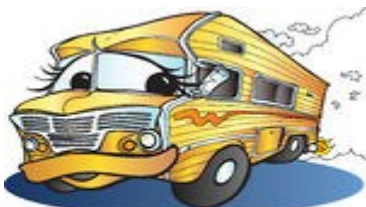
My real home has wheels!