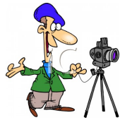
Luncheon and Special Event