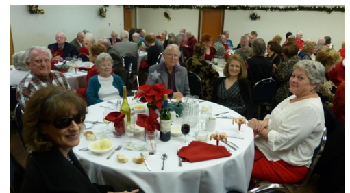
Everyone had a wonderful Christmas Luncheon.