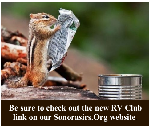
Be sure to check out the new RV Club link on our Sonorasirs.Org website

Again ...the Bible was correct..."A soft answer does turn away wrath".