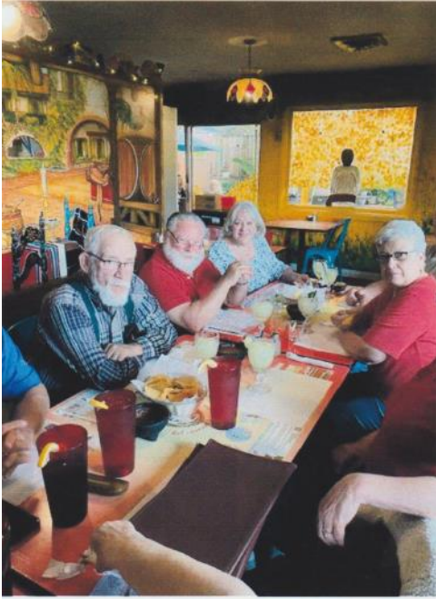
Group dinner at a Mexican Restaurant