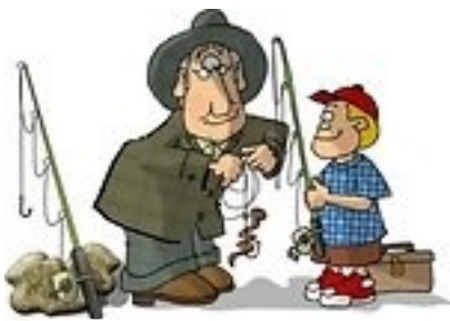
Fishing with Grandpa: Wow!